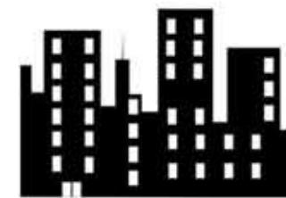
Kamal R, 10 th Grade

Tall buildings with 1, 00,000 floors that can generate electricity from thunder. Cars that have automatic safety mode preventing accidents. Citizens following road rules with sincerity. Pollution control chips installed in all vehicles and machinery that prevent emission of harmful gas in to the environment. My future city will reverse everything happening today. Let us use the technological advancements in shaping up our future!